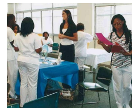
Health related vendors at job fair